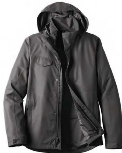
J900 OUTER SHELL JACKET

Each Collective style is compelling on its own. Yet, it can easily Zip in and layer with other Collective pieces until you have the right level of weather protection in the right colors.