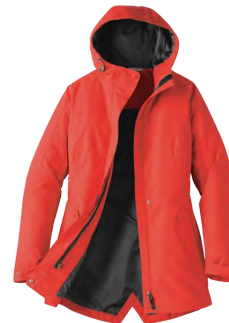
L900 LADIES OUTER SHELL JACKET